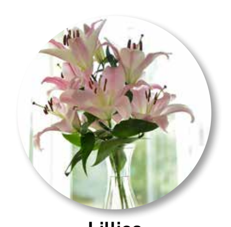
Lillies (all varieties and all parts of the lilly, including the water from the vase is toxic to cats.)

Giving and receiving flowers or plants shouldn't induce anxiety! If you're not sure whether your pet can be trusted around house plants, or if you're giving a plant or bouquet as a gift, please avoid the following toxic plants and flowers.